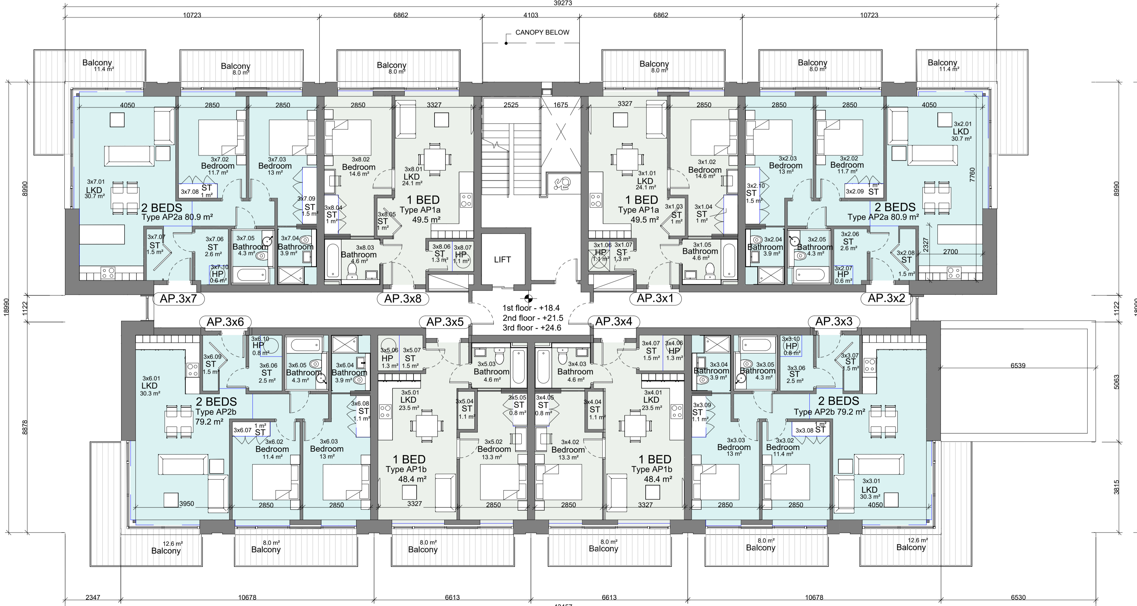
01 Typical floor plan SCALE 1:100